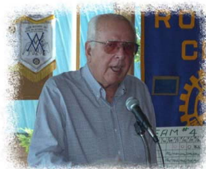
Our Prez has fallen into the typical politician's trap... just get a pair of rose colored glasses and all things are just rosy.

Billings - all club billings are due 10 days after receipt. A bill not paid 30 days after receipt is considered past due.