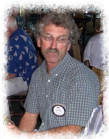
"I don't know who designed that golf course, but he's definitely a sadist."